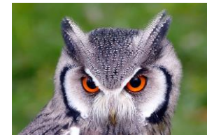
Southern white-faced owl