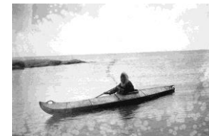
Then: Inuit in kayak in 1900