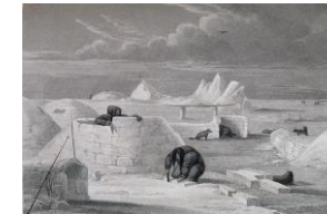
Then: Inuit Houses (igloos) in 1824

Living Montessori Now Blog | Living Montessori Now Free Printables Bits of Positivity Free Montessori Word Art Bits of Positivity Character Education Posts Christina Chitwood Free Kids' Printables Shop | Facebook | Pinterest | Twitter | Google+ Instagram | YouTube