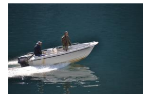
Now: Inuit in motor boat