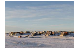
Now: Inuit houses today (Arctic community of Cambridge Bay in Nunavut, Canada, in the fall with snow on the ground)