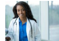
doctor in hospital clinic