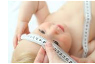
nurse measuring baby