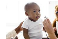
baby getting wellness exam