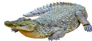
Nile crocodile ( Crocodylus niloticus )

Thank you for following Living Montessori Now! Find more educational resources here: